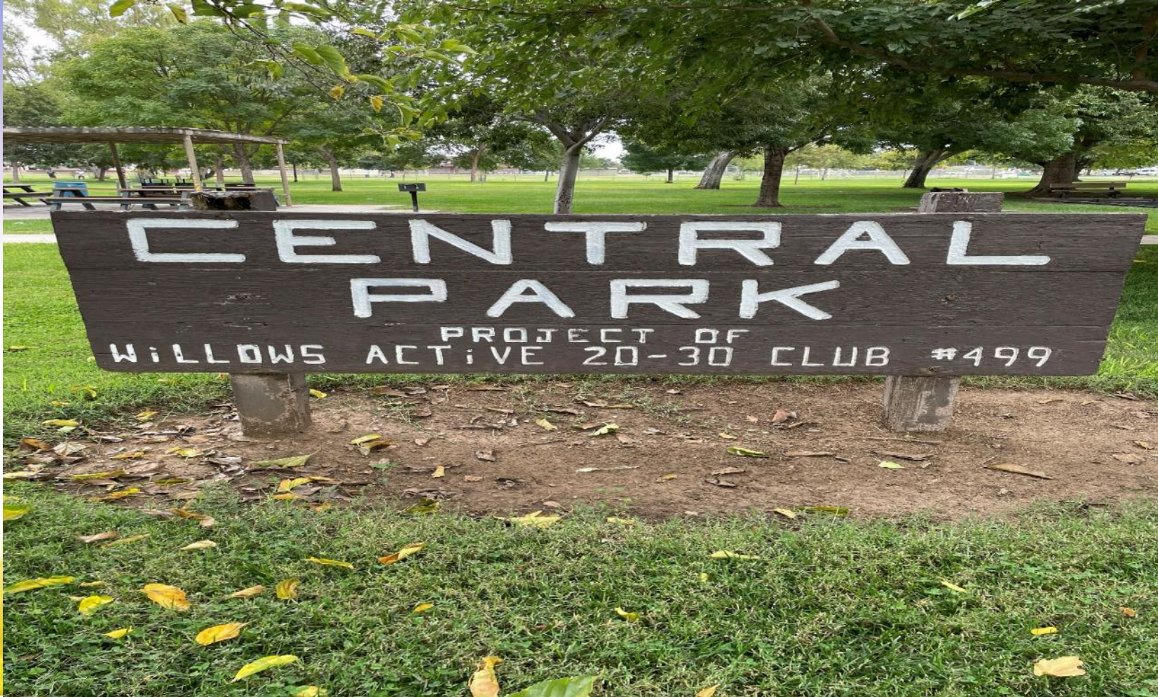
Central Park (20/30 Park)